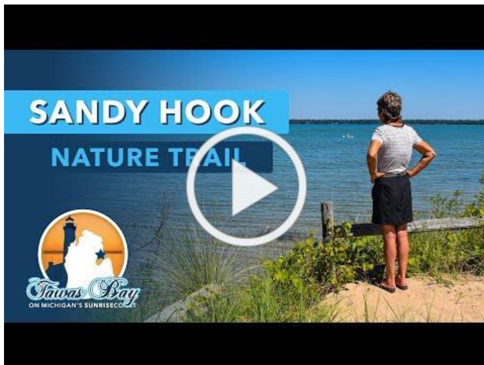
Sandy Hook Nature Trail at Tawas Point Video by Great Getaways TV

March 21 - Welcome Spring! March 25 - Spring Craft Show April 22- Iosco County Family Fun Fair May 12-13 - Tawas Point Migration Days