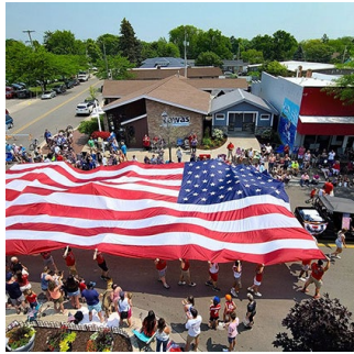
Independence Day Celebration July 4