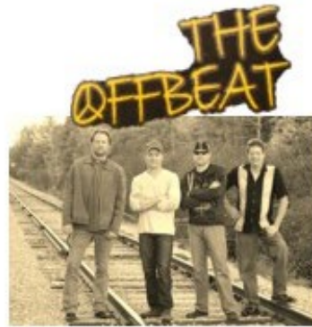
The Offbeat July 13