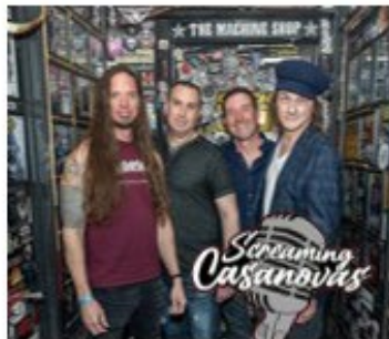
Screaming Casanovas August 10