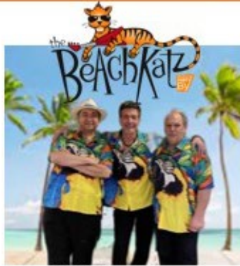
The Beach Katz July 6